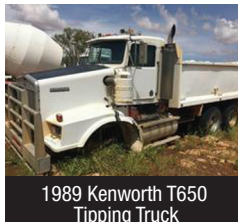
1989 Kenworth T650 Tipping Truck