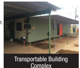
Transportable Building Complex

Expressions of Interest including Firm Offers to Purchase Are Invited Closing 2pm Friday 24th June 2016 Online EOI / Offers