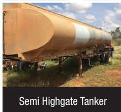
Semi Highgate Tanker