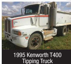
1995 Kenworth T400 Tipping Truck