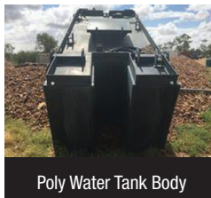
Poly Water Tank Body