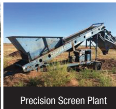
Precision Screen Plant