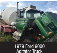
1979 Ford 9000 Agitator Truck