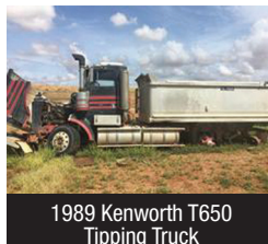
1989 Kenworth T650 Tipping Truck