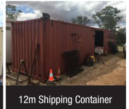
12m Shipping Container