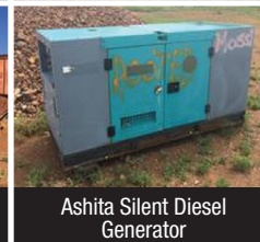
Ashita Silent Diesel Generator