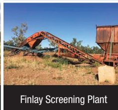
Finlay Screening Plant