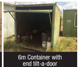
6m Container with end tilt-a-door