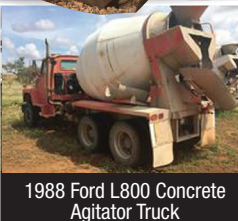
1988 Ford L800 Concrete Agitator Truck